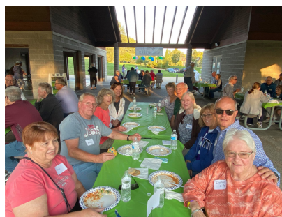
Volunteers at the annual Volunteer Appreciation Picnic