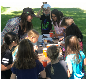
Garden to Table Campers learning about soil

From our first annual 5K, to Garden Camp, Mobile Olympics and Volunteer Appreciation Picnic, Summer 2021 was our busiest yet!