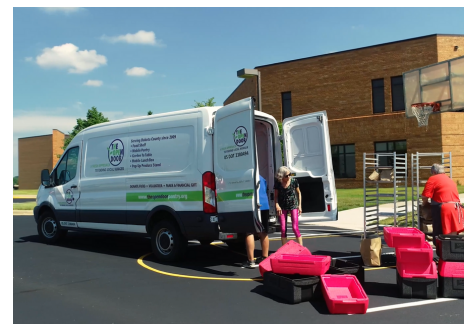
Volunteers for Mobile Lunchbox load up vans and deliver meals to low-income students in 26 neighborhoods, across 4 school districts, 5 days a week during the summer months.