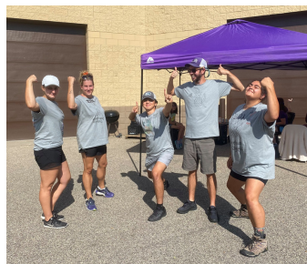
Mobile team at the Warehouse Olympics