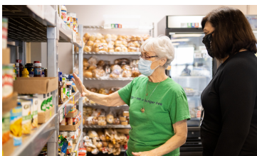
Eagan Pantry Volunteers re-stocking shelves

Our Volunteers have always been the center of our mission at The Open Door and are the ones who make our work possible. From sorting food to tending gardens, collecting client data or delivering meals to kids, nothing we do happens without them. This summer, they outdid themselves, not just breaking their "hours donated record" in July (4,015) but then breaking it again in August (4,235)! In total, 750 of our volunteers donated 11,612 hours of their time to The Open Door this summer. Their donated time allowed us to grow our summer programs to be bigger than ever before!