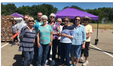
Volunteers at weekly Metcalf Distribution

Our Volunteers have always been the center of our mission at The Open Door and are the ones who make our work possible. From sorting food to tending gardens, collecting client data or delivering meals to kids, nothing we do happens without them. This summer, they outdid themselves, not just breaking their "hours donated record" in July (4,015) but then breaking it again in August (4,235)! In total, 750 of our volunteers donated 11,612 hours of their time to The Open Door this summer. Their donated time allowed us to grow our summer programs to be bigger than ever before!