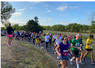
The Open Door's 1st Annual 5K Race at Casperson Park