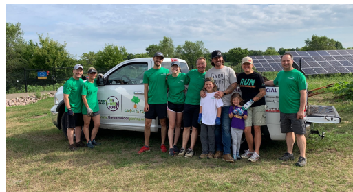
River Valley Church Volunteers helping tend to our garden plots

Beyond helping people around the community grow their own healthy food, Alpa has enjoyed working with hundreds of people this summer and is proud of how much her clients have developed in their skills and their confidence as gardeners.